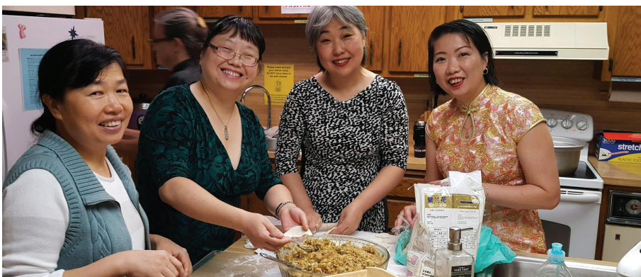
Making dumplings for the Chinese new moon festival, fall 2019. Galilee & MN Faith Chinese Lutheran Churches together forever, thanks be to God!

To gather people together to hear the story of God's love in Jesus Christ, to be nurtured in faith and knowledge, and to share the Good News through word and deed.