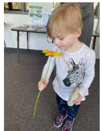
"May Flowers"

To gather people together to hear the story of God's love in Jesus Christ, to be nurtured in faith and knowledge, and to share the Good News through word and deed.