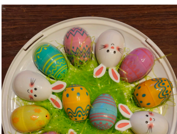
An early "Easter Bunny" dropped off a tray of eggs to enjoy.