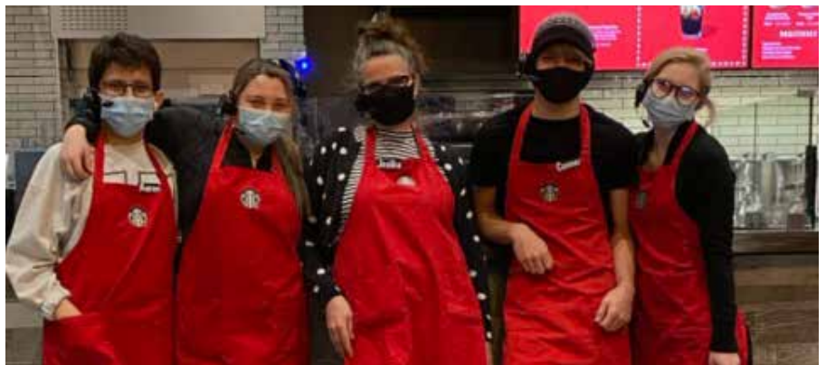
Happy New Year to the people of Galilee from the Food Donation Connection and the crew at Starbucks in White Bear Lake.

To gather people together to hear the story of God's love in Jesus Christ, to be nurtured in faith and knowledge, and to share the Good News through word and deed.