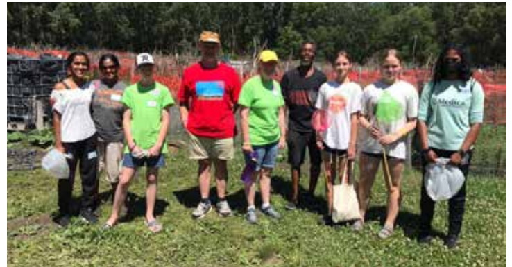
Photo: This summer we have the pleasure of hosting youth groups who come from different congregations in the midwest to volunteer in the Rice Street Gardens. this particular group came from very nearby: Roseville Minnesota! They are from Prince of Peace Lutheran Church . We also hosted youth from First Presbyterian Church in Miller, South Dakota. God Bless the Rice Street Gardens!